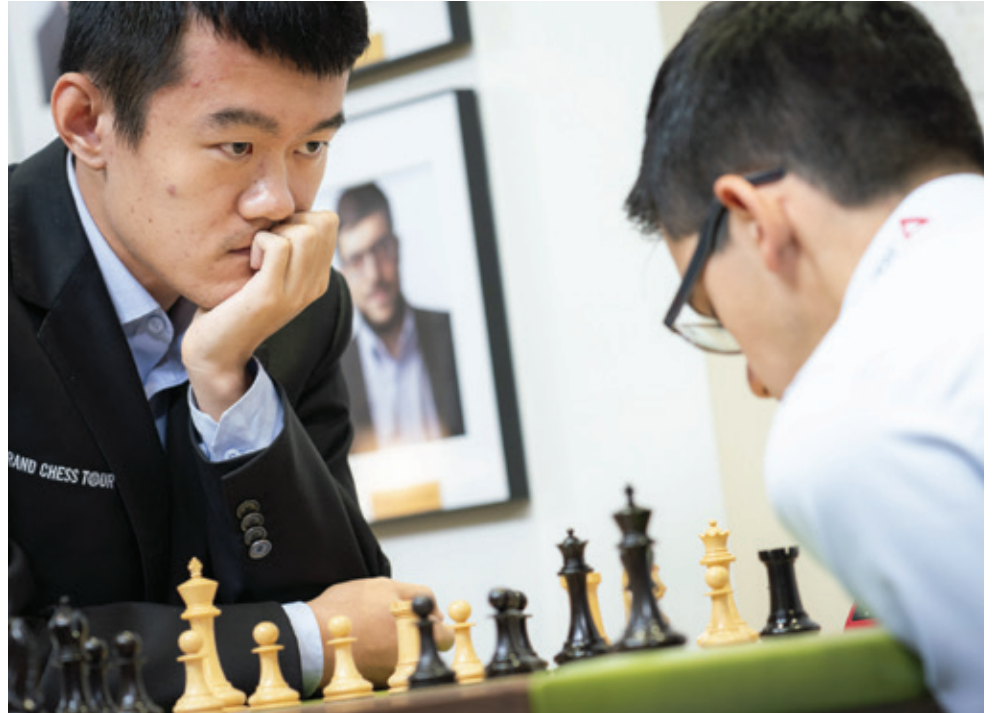
GM DING LIREN AND GM ANISH GIRI, ROUND 5

The round before the day off had the highest number of decisive results and a shake up in the leaderboard. There is now a three way tie for first place as Ding Liren joins Viswanathan Anand and Fabiano Caruana with a win over Anish Giri. Anand had an easy day in the office while Caruana had to put in quite a lot of work to earn his half a point. With a win over Hikaru Nakamura, Ian Nepomniachtchi joins the big tie for fourth place. The games will resume Friday with a lot of exciting matchups ahead!