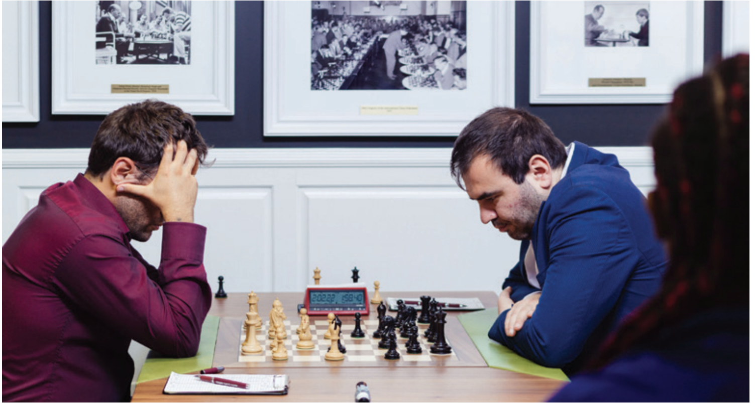
ARONIAN VS. MAMEDYAROV // CRYSTAL FULLER