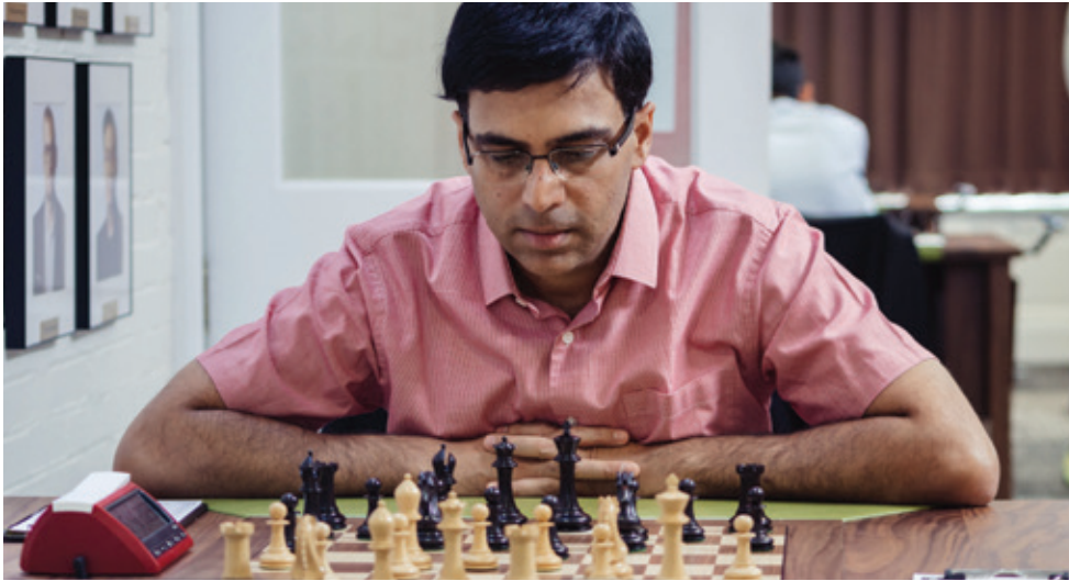
GM V. ANAND

A well prepared line in the Giuoco Piano gave Anand a comfortable draw with the black pieces. Vachier-Lagrave was surprised by 8...a5. He went for a forcing line opening the center, trading queens and grabbing the f7 pawn. However, Anand had quick counterplay on the kingside due to being ahead in development. The former World Champion joked that in the final position where he forced a perpetual check, he was in the perfect position to attack were it not for his king and bishop on the back rank