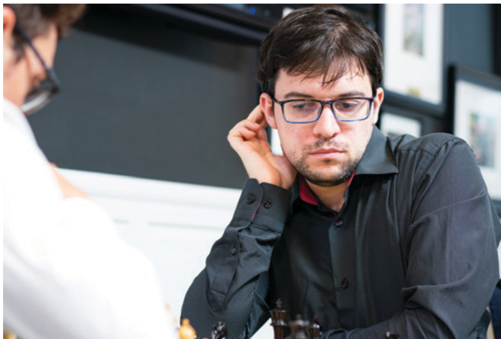
GM MAXIME VACHIER-LAGRAVE, ROUND 6

The players returned to action today but the rest day did not seem to impact the player standings in the tournament, as all of the round 6 games ended in a draw. Each player is unique in how they choose to spend their day off; Sergey Karjakin played in an online Fischer Random qualifier, Anish Giri went to the Saint Louis Zoo, and Magnus Carlsen was invited to throw the first pitch for the Cardinals in their game against the Colorado Rockies. The World Champion discussed his experience with Maurice Ashley, explaining how uncomfortable and nervous he felt in an unfamiliar territory. Unfortunately, these fun-filled activities did not influence their play over the board as the games unfolded slowly. For a good part of the round, it seemed as though Viswanathan Anand would emerge as the sole leader. Unfortunately, the former World Champion was not able to convert his material advantage. Unsurprisingly, Anand was seemingly disappointed about the result of the game, as this marks his second big miss of the tournament. Tomorrow, the two co-leaders, Ding Liren and Viswanathan Anand, will be facing off.