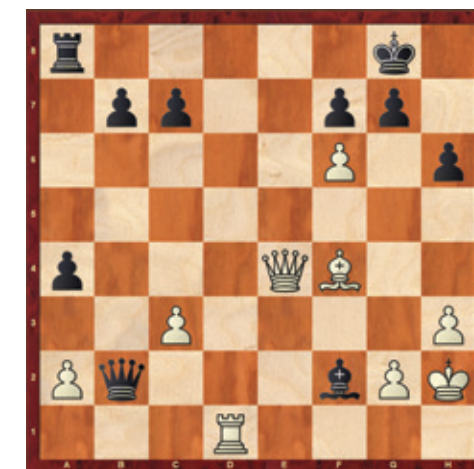
23.Kh2 Qb6 24.Rd1 Qxb2 25.f6 Qxc3