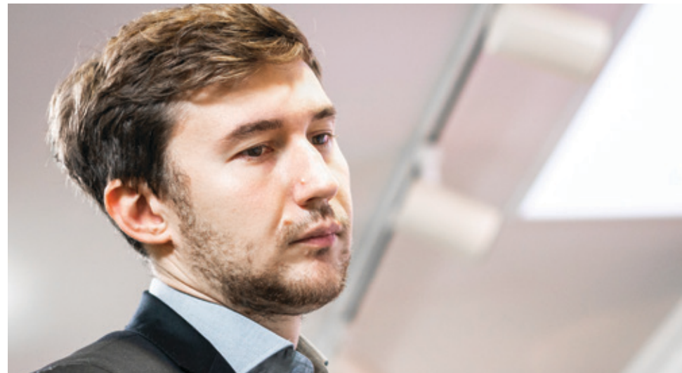
GM S. KARJAKIN