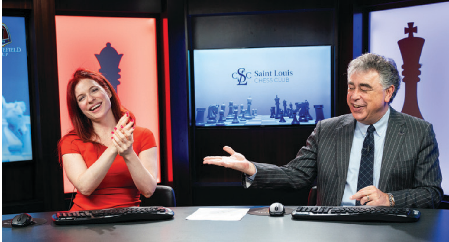
WGM JENNIFER SHAHADE & GM YASSER SEIRAWAN