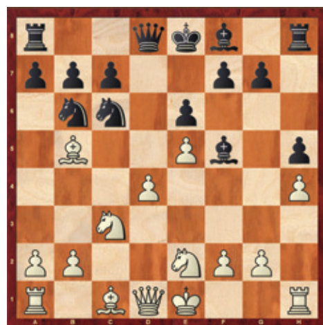
GM S. MAMEDYAROV

This 14-move draw with repetition was an anticlimactic way of ending the game. Mamedyarov explained that he normally doesn't make quick draws and likes to keep the game going, but was tired today and needed the break, even though yesterday was the tournament rest day. He also did not seem to mind the fact that he wasted his white pieces. Tomorrow, he will have black against Maxime Vachier-Lagrave, while So will be facing Sergey Karjakin with the white pieces.