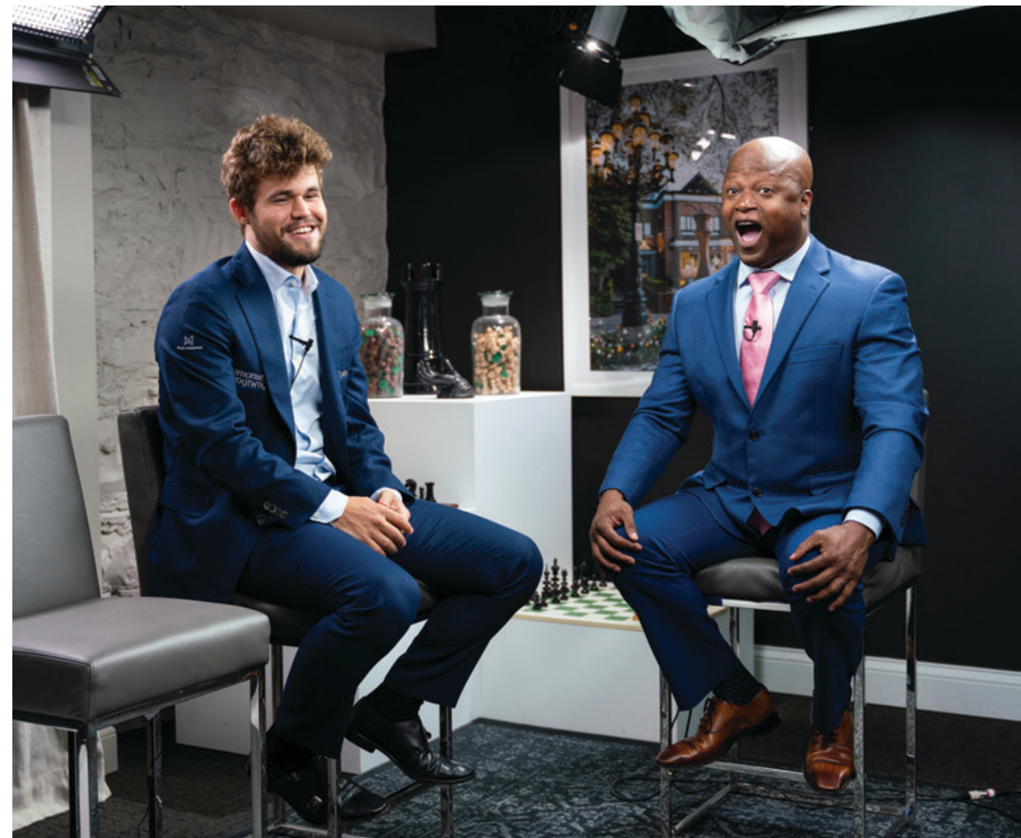
GM MAGNUS CARLSEN & GM MAURICE ASHLEY