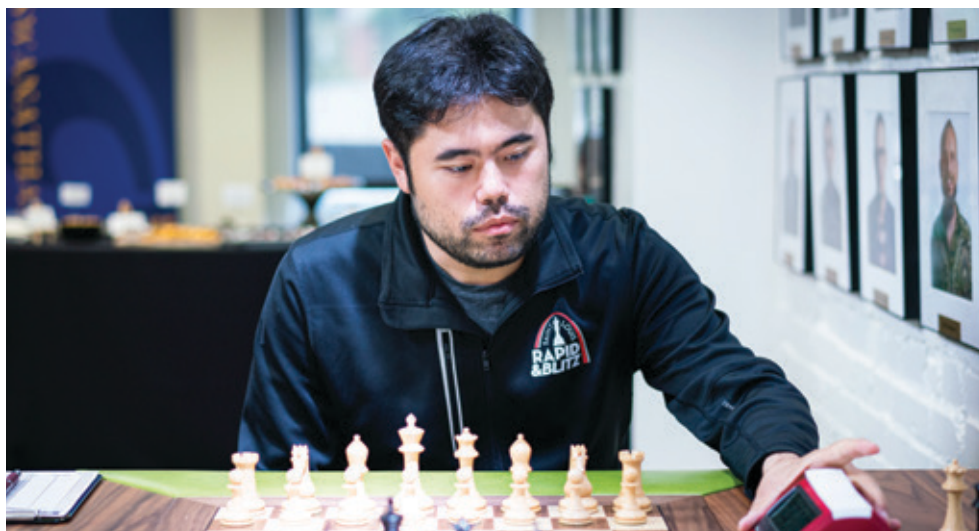
GM H. NAKAMURA

“It’s not the sort of position you dream of getting from the opening, obviously, since there is so little excitement”, Magnus Carlsen told Maurice Ashley in the postgame interview. Nakamura essayed the Rossolimo Variation avoiding Carlsen’s Sveshnikov. By move 13, they reached a position where Black’s pawn structure was compromised and White had a nice blockade of the pawns with his knights against Black’s bishop pair. Carlsen was worried about this line before and during the World Championship, as the computer doesn’t see the danger of the position and evaluates it as equal. The World Champion was concerned that he was completely stuck and White can slowly improve but in fact, Black is just very solid and it’s hard to get to his weaknesses. Neither player was able to find a way to make progress, ending the game with a repetition in 30 moves. Carlsen will have the white pieces in the next two rounds and told Ashley that “it’s time to make a move.”