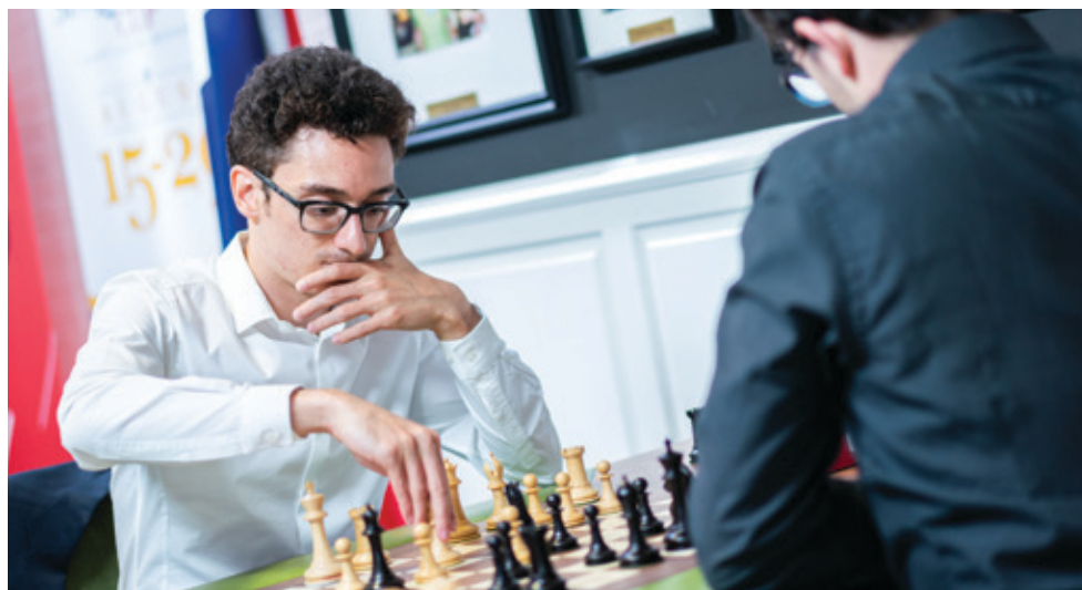
CARUANA VS. VACHIER-LAGRAVE